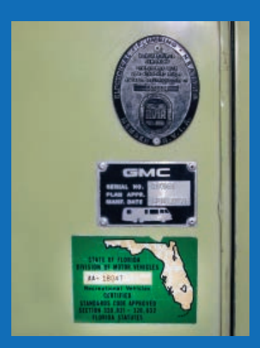
RVIA badge on all RVs, GMC plate on about 20% of GMC Motorhomes, state decal applied as required.

GMMA Team, Allied Vaughn Livonia, MI 48150 p. 734-261-5086 f. 734-261-5216 BE SURE TO CHECK OUT www.gmmediaarchive.com www.gmphotostore.com